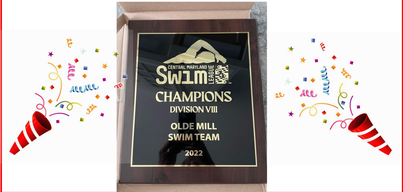
OMSC and Snack Shack

Congratulations Olde Mill Swim Team on becoming the Champions of Division VIII.