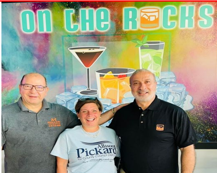
Hey D2 neighbors, have you popped into On the Rocks on Old Mill Rd? Fantastic new watering hole with fresh menu and great