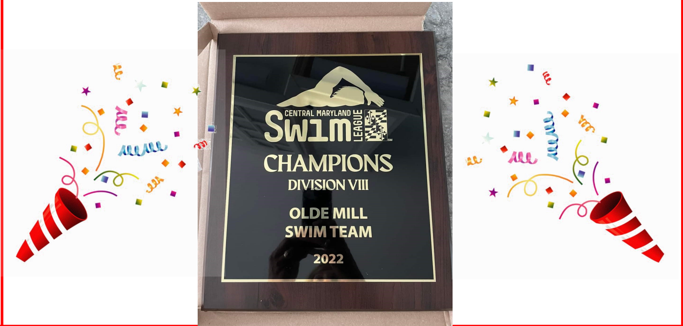
OMSC and Snack Shack

Congratulations Olde Mill Swim Team on becoming the Champions of Division VIII.