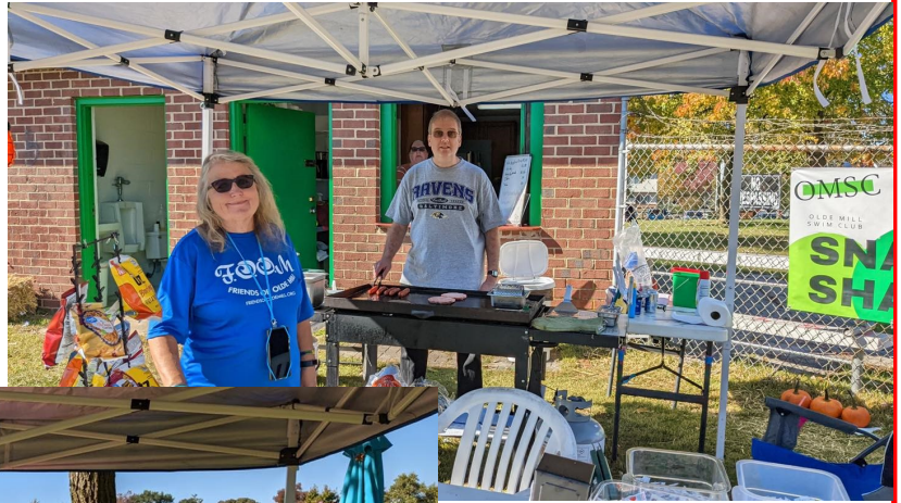
Friends of Olde Mill Fall Fest October 22nd