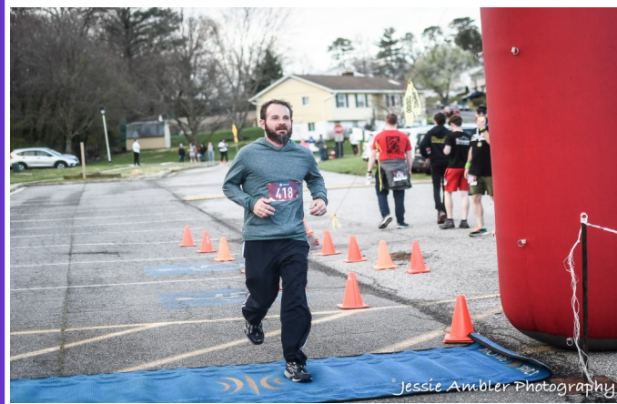
Jessie Ambler Photography