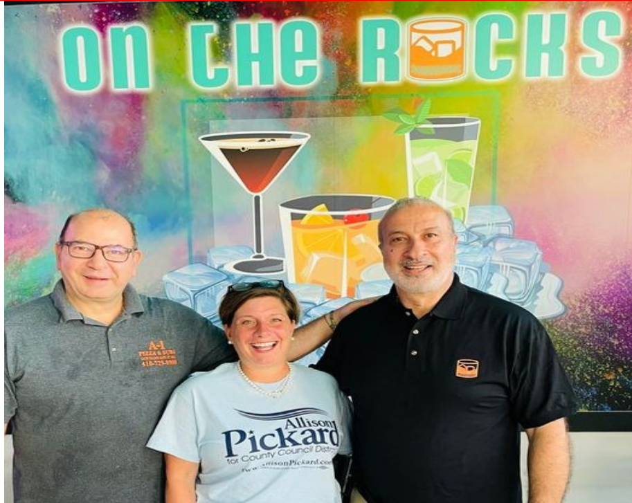
Hey D2 neighbors, have you popped into On the Rocks on Old Mill Rd? Fantastic new watering hole with fresh menu and great