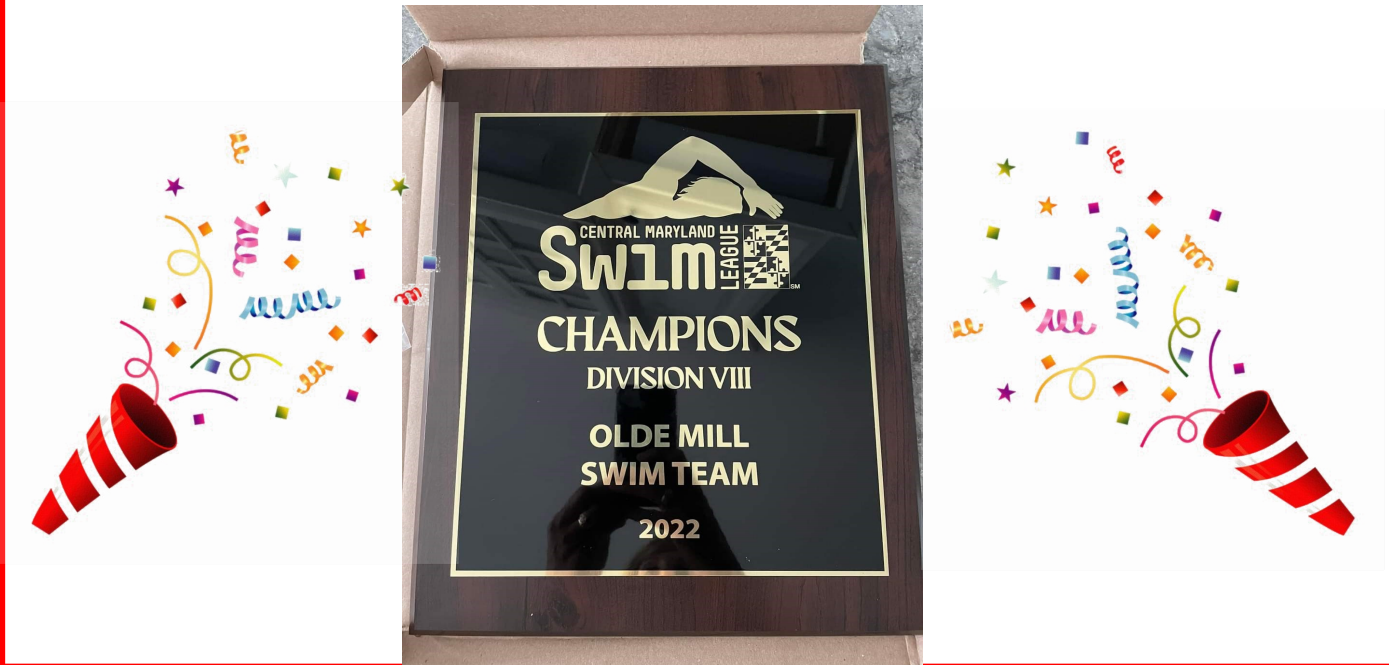
OMSC and Snack Shack

Congratulations Olde Mill Swim Team on becoming the Champions of Division VIII.