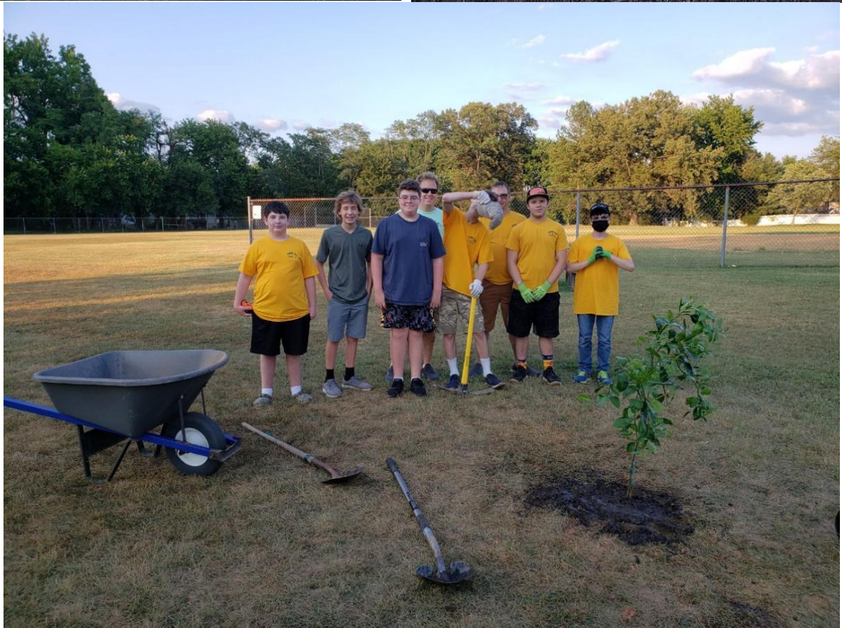
Thank you Boy Scout Troop 975 for planting two orange trees at Barlowe Park!