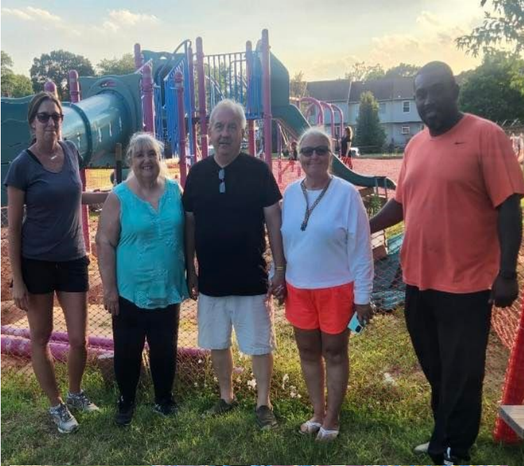
Playground installation work